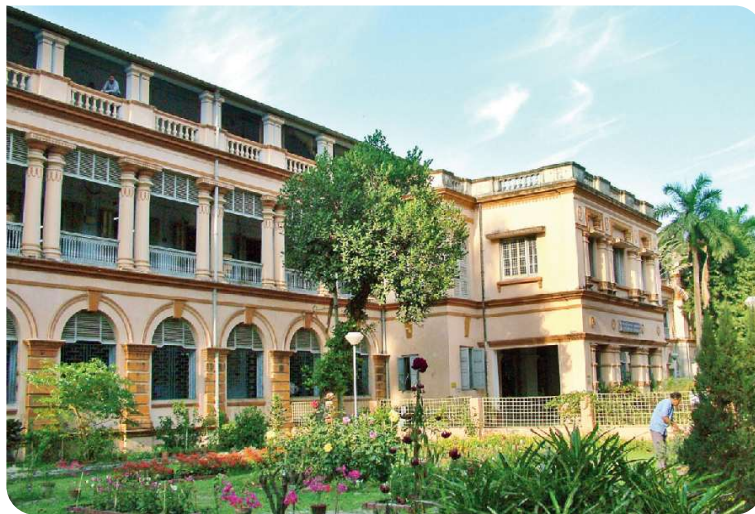
Jadavpur University File image