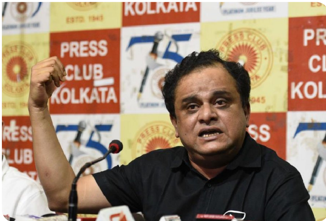
Bratya Basu File image