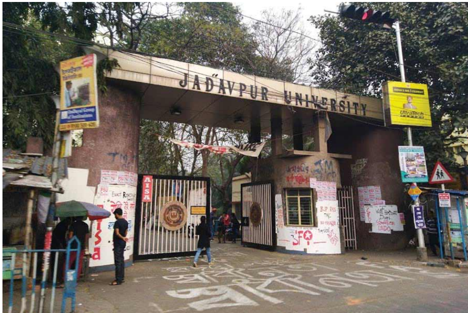
Jadavpur University File image

SUBHANKAR CHOWDHURY | PUBLISHED 31.10.23, 08:29 AM