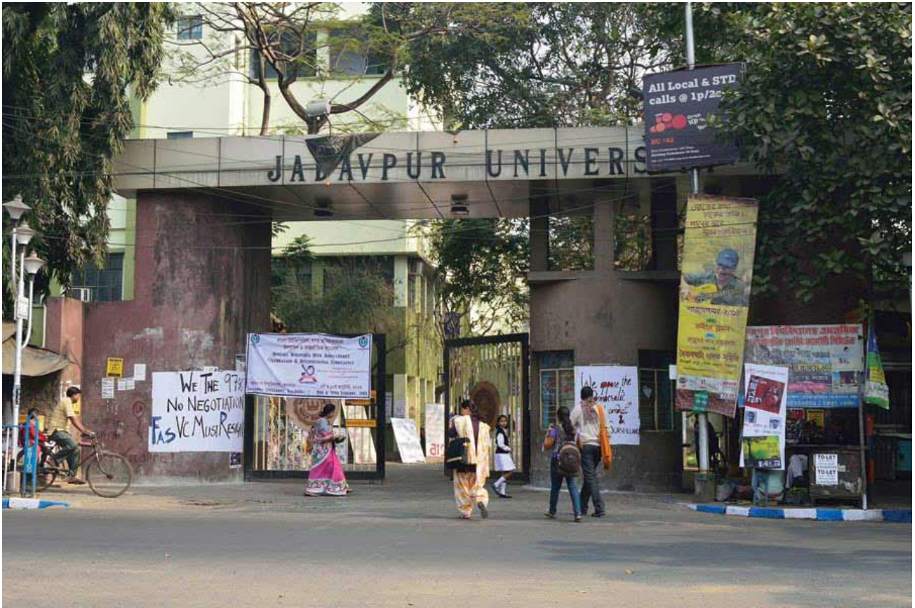
Representational picture. File picture