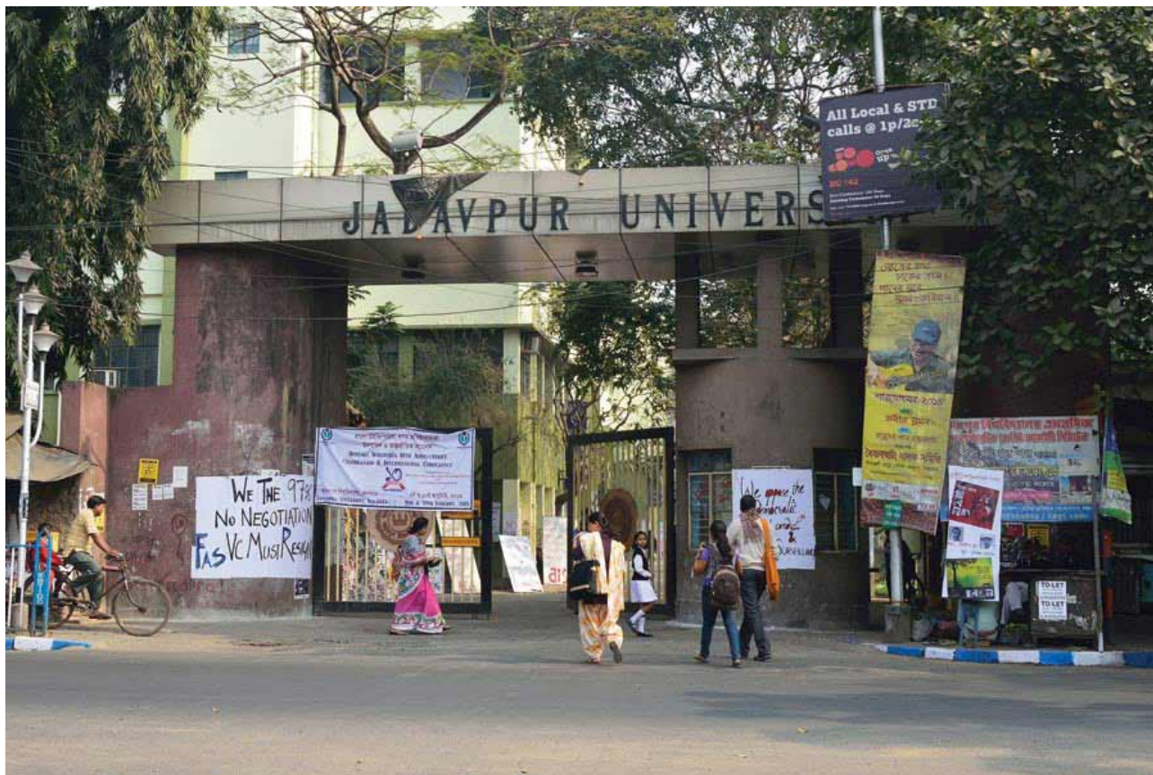
Jadavpur University. File picture

The inquiry committee formed by Jadavpur University to probe into the circumstances leading to the death of a fresher has concluded that the victim was singled out for severe pre-planned ragging, which included possible sexual abuse.