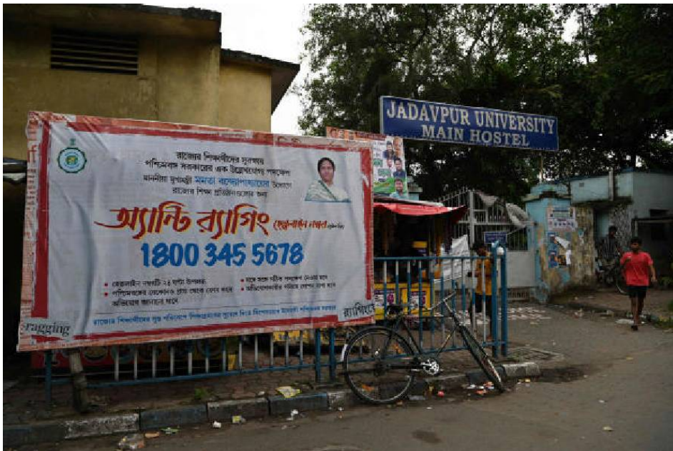
Bengal govt's anti-ragging helpline displayed on a poster outside the JU Main Hostel