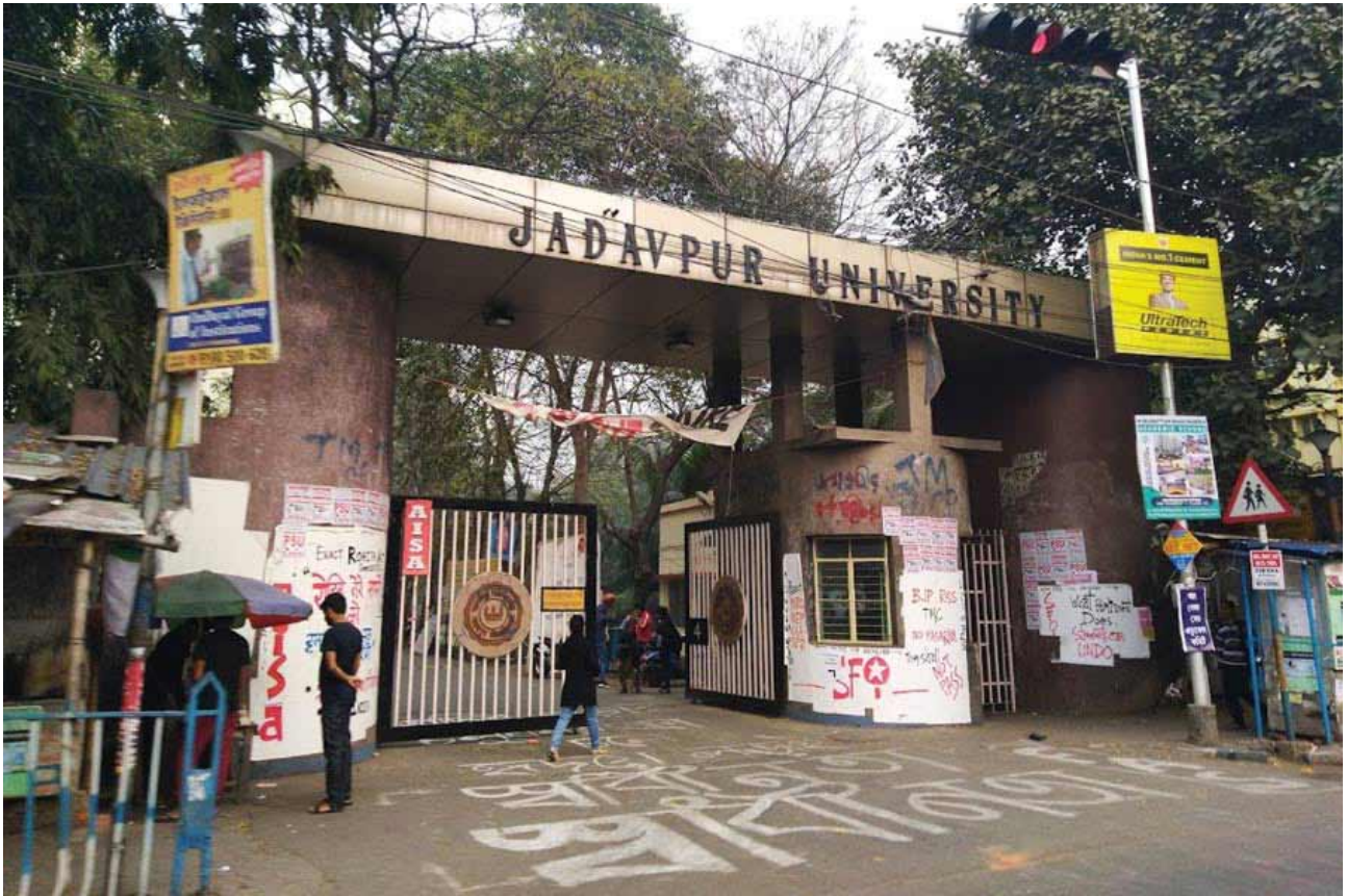
Jadavpur University.

One month after the death of an undergraduate student at the Jadavpur University boys' hostel allegedly after ragging by seniors, the recommendations made by a committee to stop the menace are yet to be implemented as the varsity is waiting for the Executive Committee meeting to vet those proposals.