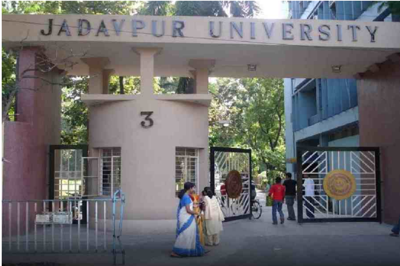
Jadavpur University.